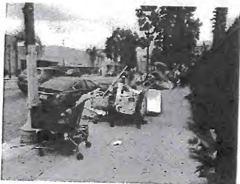
Vermont Marathon 1.JPG 3110K